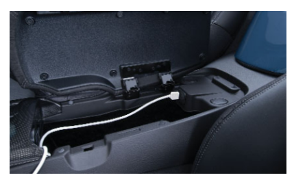
Note: Not all USB devices may be supported.